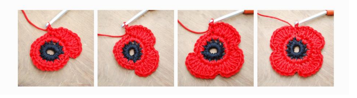
Repeat two more times = 4 petals = 40 stitches

2nd Petal. 1 dc into next stitch, 2 tr into next stitch, 2 tr into next stitch, 2 tr into next stitch, 2 tr into next stitch, 1 sc into next st.