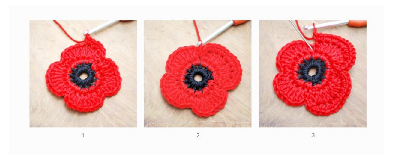
Pattern adapted from Emma Leith

Into each tr stitch from previous round work 2 dc followed by a ss in between the petals from previous round. Repeat this until you have gone around the whole flower back to the start and ss into first petal. Tie off.