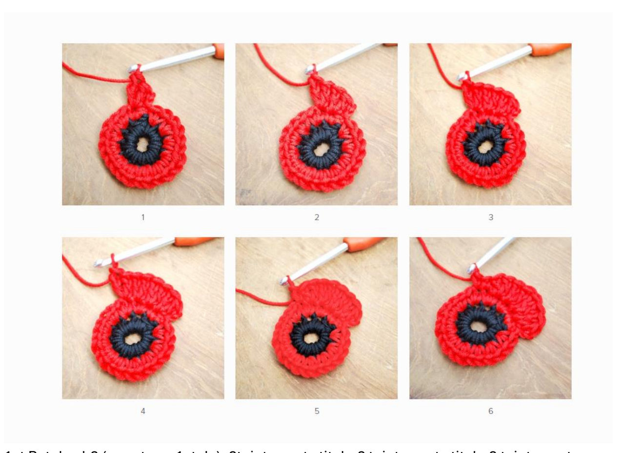
1st Petal. ch2 (counts as 1st dc), 2tr into next stitch, 2 tr into next stitch, 2 tr into next stitch, 1sc into next st.

2nd Petal. 1 dc into next stitch, 2 tr into next stitch, 2 tr into next stitch, 2 tr into next stitch, 2 tr into next stitch, 1 sc into next st.